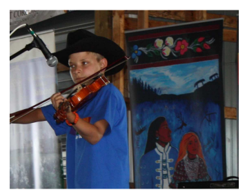
Young fiddler at Batoche, 2009